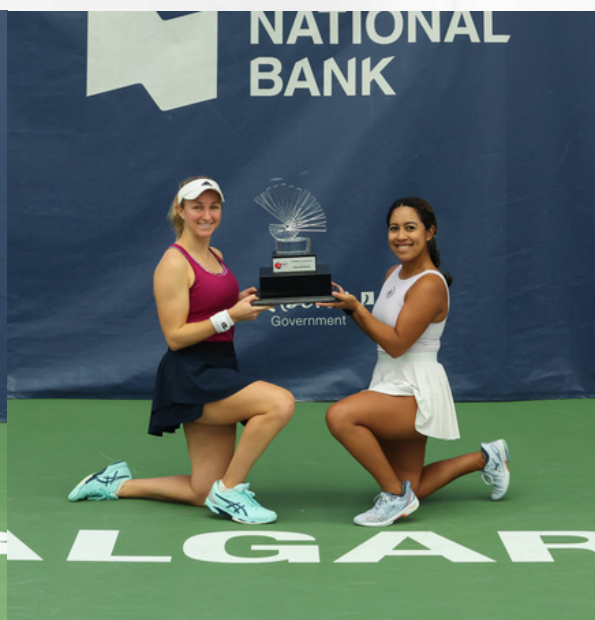
2022 WOMEN'S DOUBLES CHAMPIONS