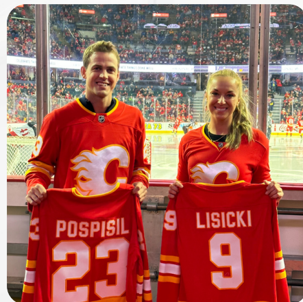
EVENT PROMOTION On ice and puck drop at the Calgary Flames Game