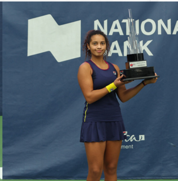
2022 WOMEN'S SINGLES CHAMPION