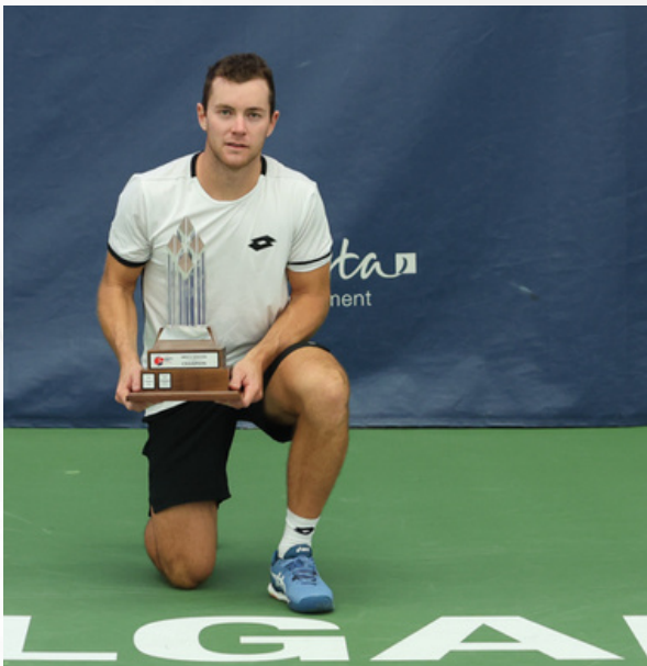
2022 MEN'S SINGLES CHAMPION