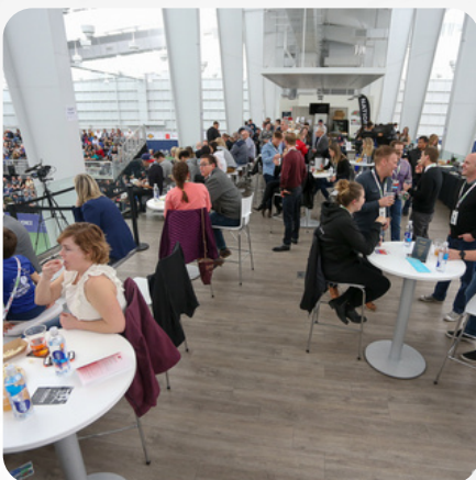
VIP HOSPITALITY LOUNGE Sponsor Lounge