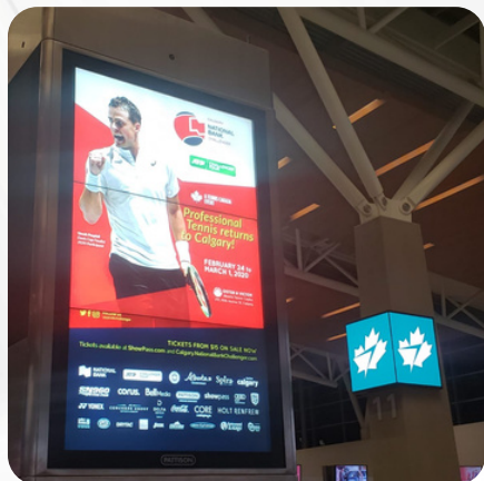
DIGITAL SIGNAGE Calgary YYC Airport