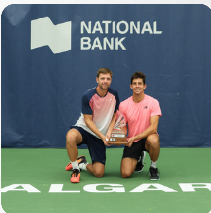
BACKWALL BRANDING Centre Court