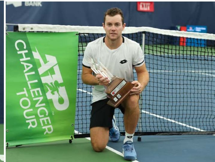
Men's Singles Champion: Dominik Koepfer (Germany) Men's Singles Finalist: Aleksandar Vukic (Australia)

This year's competition saw a main draw event with 32 singles main draw players, 24 players in singles qualifying and 16 team (32 player) doubles draw (per gender).